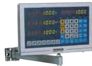
i Detailed information for DPA 2000 on page 95