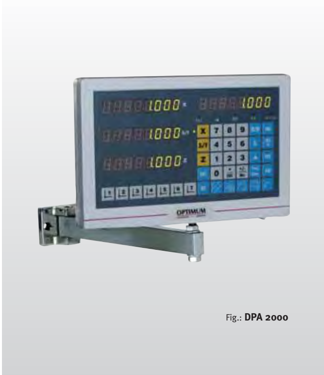
Fig.: DPA 2000